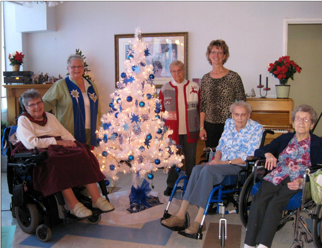
Resident and staff at the Palliser Regional Care Home in Swift Current celebrate "Blue Christmas".